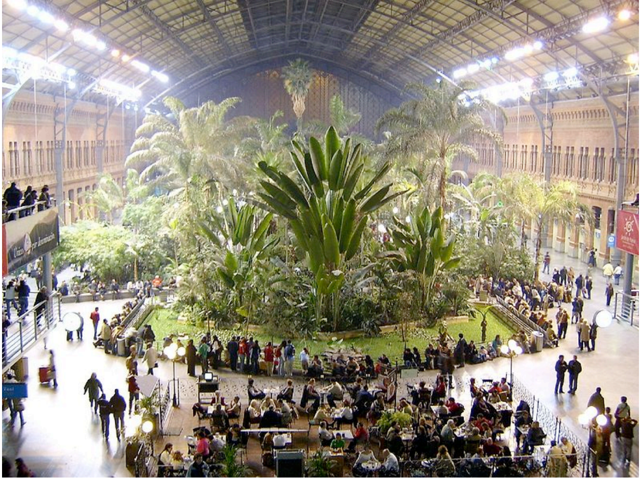
An interior garden in the Madrid Train Station