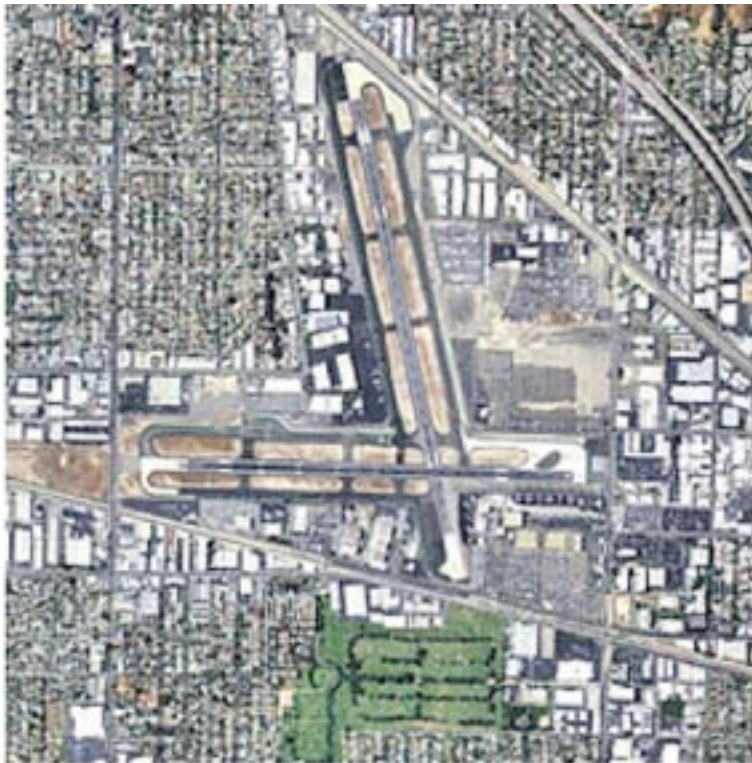
Image: Vehicular access to HSR station blocked by two rail lines and two runways

Any newcomer driving into the Burbank Airport area will find the area difficult to navigate. The runways block east west traffic. The rail lines block the north south routes. Streets dead end or go for miles without a cross street. Existing signage into the airport is poor. It is easy to get lost.