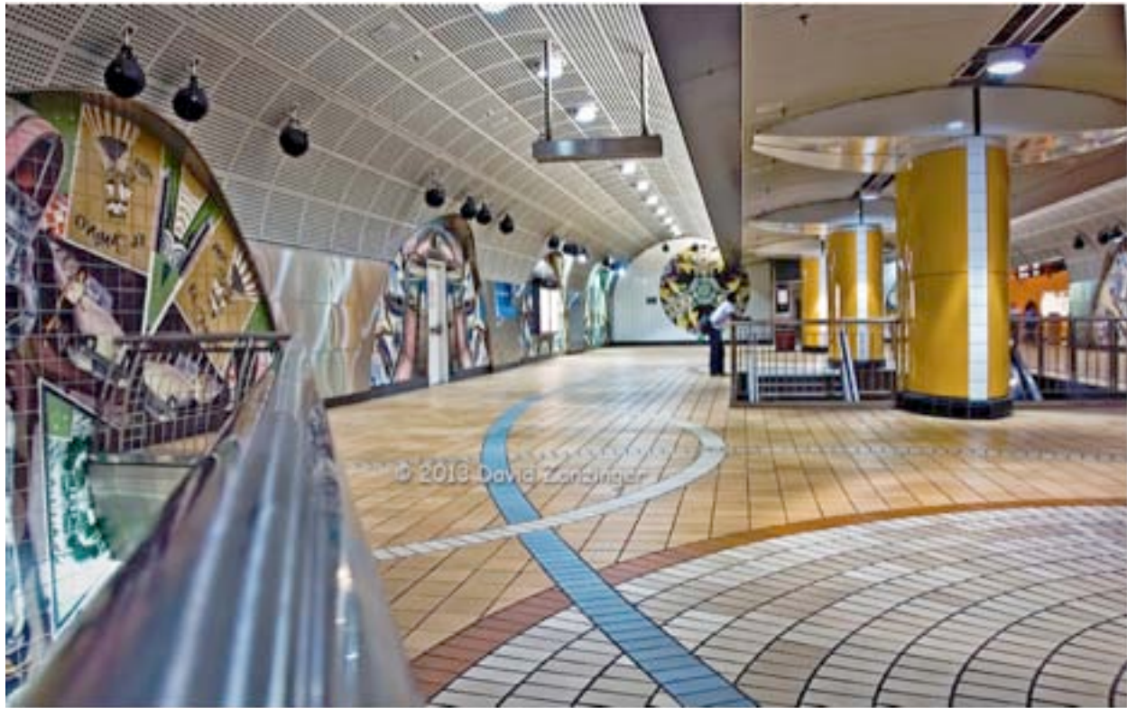
Image: North Hollywood Station Interior

subway station. Trains run every ten minutes into downtown Los Angeles, and at night, every twenty minutes, with free shuttle service to the Airport.