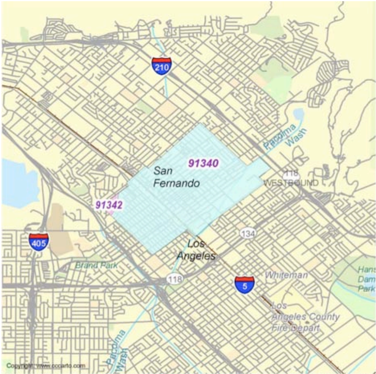
Image: San Fernando City highlighted. The 5 Freeway insignia is misplaced and shown on San Fernando Road, the HSR route. The Mission of San Fernando is located in Brand Park.

5.) A HSR station in San Fernando City is 22 miles from Union Station and 42 miles from Palmdale. Locating the HSR here will improve travel times for many Valley residents. The proposed HSR Station at Burbank Airport is nine miles further south of this location, requiring extra travel time and expense for passengers and creating greater congestion on the 5 Freeway.